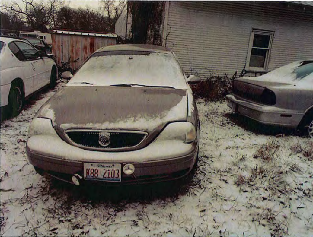
Date: 01/22/2014 Time: 1:48 P.M. Direction: south Exposure #: 005 Comments: waste vehicle, expired plate