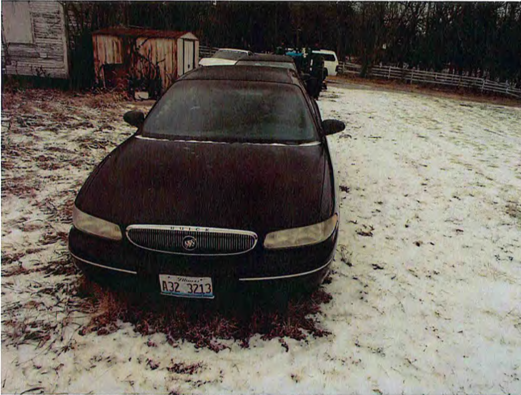
Date: 01/22/2014 Time: 1:47 P.M. Direction: north Exposure #: 003 Comments: waste vehicle; rear passenger side window down