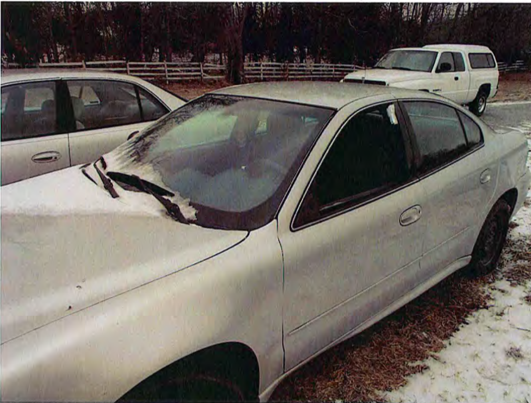
Date: 01/22/2014 Time: 1:48 P.M. Direction: northeast Exposure #: 008 Comments: waste vehicle; window down or missing; same vehicle in photo 006

File Names: 0818105006~01222014-[001-013].jpg