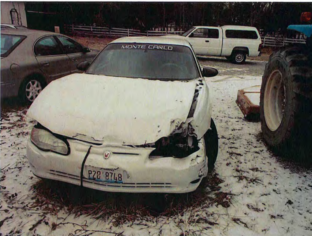
Date: 01/22/2014 Time: 1:48 P.M. Direction: north Exposure #: 004 Comments: waste vehicle; collision damage, expired plate

File Names: 0818105006~01222014-[001-013].jpg