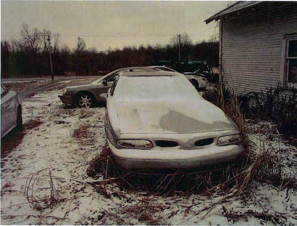
Date: 01/22/2014 Time: 1:48 P.M. Direction: east Exposure #: 007 Comments: waste vehicle; no plate, overgrown in vegetation