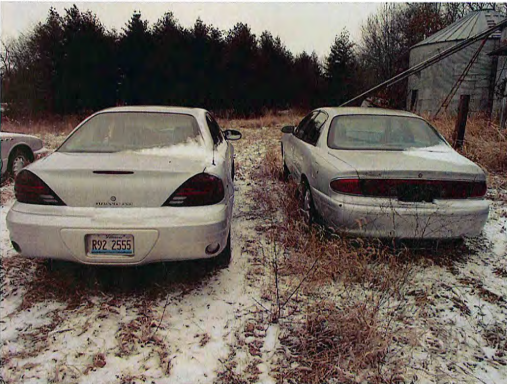
Date: 01/22/2014 Time: 1:48 P.M. Direction: west Exposure #: 006 Comments: waste vehicles; expired plate on left vehicle, no plate on right

File Names: 0818105006-01222014-[001-013].jpg